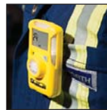
Easy To Wear