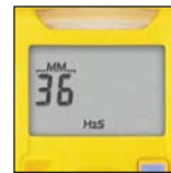
Easy to Read