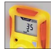
Easy to See